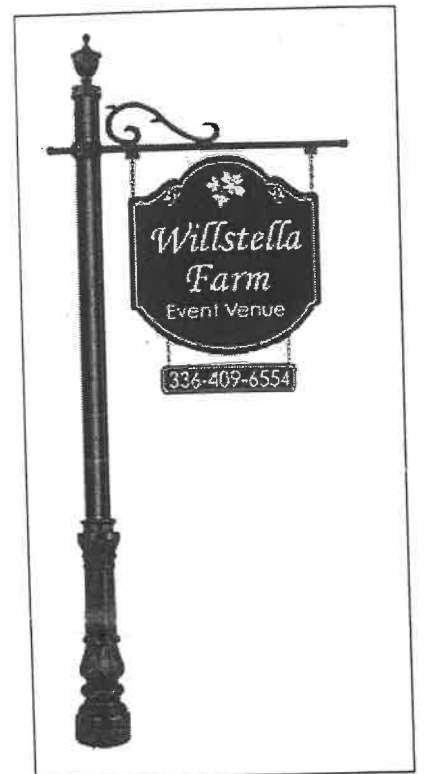
SIGN BRACKET AND SIGN EXAMPLE